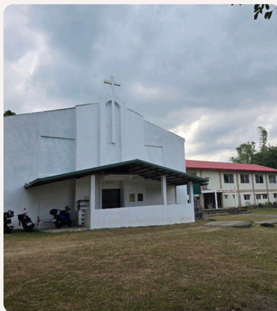
World Mission Church, Cavite